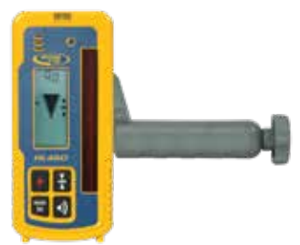
HL450 Receiver and C45 rod clamp included