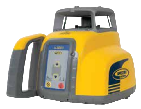
LL300S features a strong metal sunshade