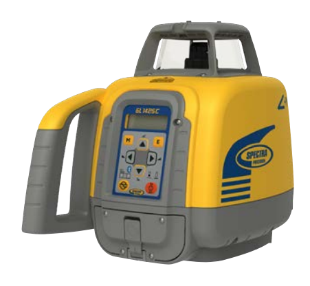
GL1425C features an enclosed lighthouse for superior ruggedness and environmental protection